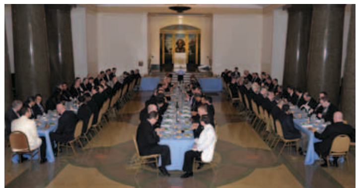
MRF members and guests enjoy the festive board in Grand Masonic Hall.