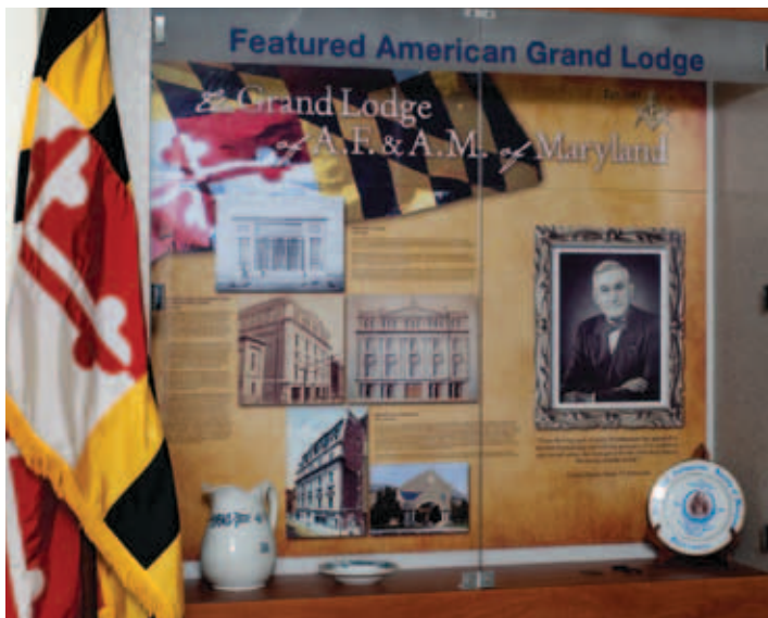
The Grand Lodge of Maryland celebrated its month in October and sent a colorful and interesting variety of materials for the display.