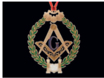
2011 Holiday Ornament The Three Great Lights in Masonry. Reissued in color! See page 3 for details and a close-up image. Made in the USA. $25.00 (No. 561)

The Memorial is a great place to shop for all those special people on your holiday list. And don't forget to include yourself! We've selected some best-selling items that are sure to please. An easy and convenient way to give a gift, your purchase is also a great way to show your support for the Memorial. Visit the Memorial's website for many more quality gifts and items.