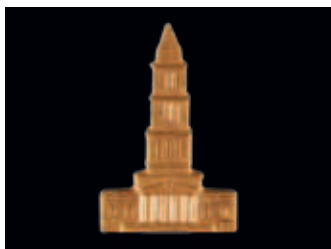
Memorial Lapel Pin Finely crafted and highly detailed, our newest lapel pin featuring the Memorial is sure to please all those on your shopping list. $8.00 (No. 515)