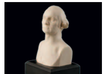
Washington Bust Based on an original sculpture by renowned artist Jean-Antoine Houdon. Perfect for any desk or bookshelf. Measures 6 1/2" tall. $20.00 (No. 526)