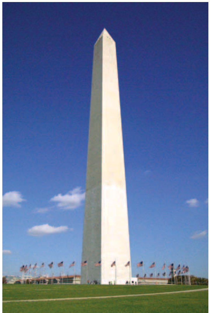
American citizens were first energized to build the Washington Monument during the centennial of Washington's birth.