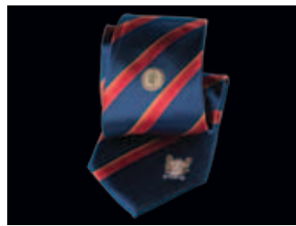
Centennial Tie 100% silk tie with wide red stripes features profile of Washington and Memorial logo. $25.00 (No. 415)