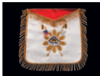
George Washington's Masonic Apron Miniature replica of the one he wore at cornerstone ceremony of the Capitol in 1793. Hand stitched and finely detailed. Approx. 7" x 7 1/2". $85.00 (No. 502)