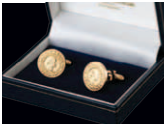
Centennial Cufflinks This stunning set features Washington's profile encircled by a laurel wreath and name of the Memorial; Post Fasteners; 3/4" diameter. $45.00 (No. 431)