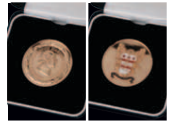
Centennial Medallion Beautiful two-sided keepsake! 1 1/2" diameter. Base Metal $35.00 (No. 439) Gold Plate $75.00 (No. 433) Sterling Silver Gilt $150.00 (No. 434)