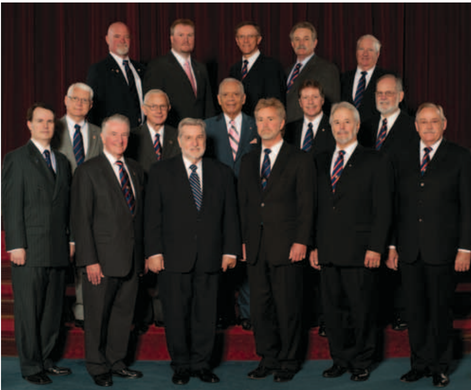
The Board of Directors met at the Memorial for the Semi-Annual Board Meeting held in August. They are pictured here in the North Lodge Room.

The Semi-Annual Board Meeting was established to provide the opportunity for our Board Members to hold at least one meeting at the Memorial each year. Per the By-Laws of the Memorial Association, the Annual Meeting of the Association is to be held on Washington's Birthday. Currently our Annual Meeting is held in conjunction with the Conference of Grand Masters of North America, which developed out of the Annual Meeting of the Memorial Association. The Conference usually meets the week of Washington's Birthday at various locations around the country; our Annual Meeting is seldom held at the Memorial. Each year the Memorial welcomes seven new members to the 21-member Board of Directors. The Board of Directors is the ultimate authority responsible for the operation of the Memorial Association and the Memorial building.