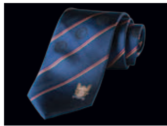
Centennial Tie 100% silk tie features Memorial logo. Thin red and gold stripes with dark, silk-screened profiles of Washington. $25.00 (No. 416)