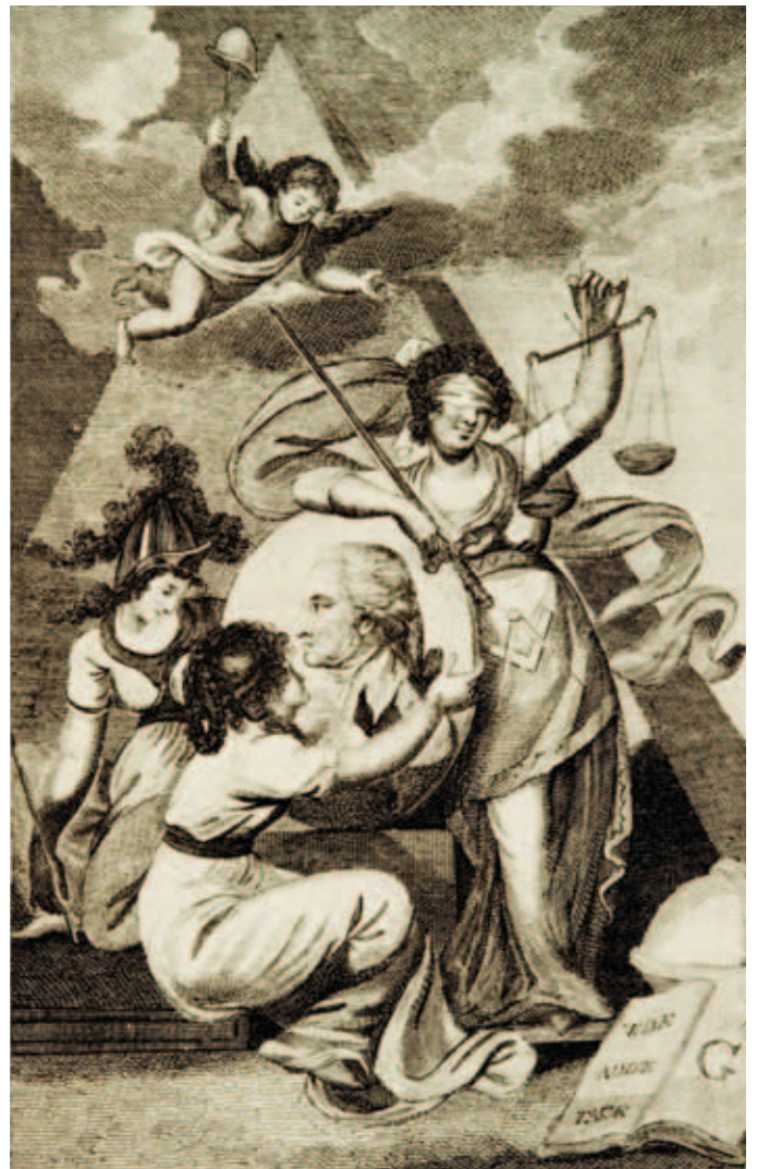
Washington is honored as a Freemason in this pictorial tribute from The Sentimental and Masonic Magazine published in Dublin, Ireland in 1795.

Twenty-five years later the Grand Lodge of New Hampshire initiated a national campaign to "erect a monument at Mt. Vernon over the remains and to the memory of our late Brother George Washington." In 1825 and 1826 New Hampshire Freemasons solicited every U.S. Grand Lodge and local Lodges in an effort to raise a total of $10,000 for its construction. Several Grand Lodges pledged funds, notably New York, Pennsylvania, Virginia and Maryland. Freemasons agreed to hold a meeting in 1827 at Washington, D.C.'s Masonic Hall to form a monument association, but the story abruptly ends there. Although a long progress report appears in the 1828 Proceedings, there is no further mention of a monument in subsequent years. Perhaps, after further consideration, the Washington family, who still owned Mount Vernon, declined participation in the monument plans, or perhaps pledge money failed to materialize. Perhaps, even more likely, is that the project evaporated with the onset of Anti-Masonic hysteria in 1828. Regardless, in 1831, the family built a new tomb on the site specified in the General's will.